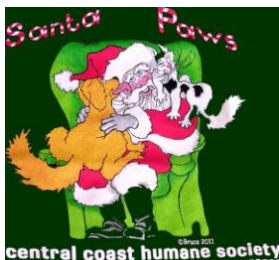
Automatic Dog Wash, Navy Blue t-shirt